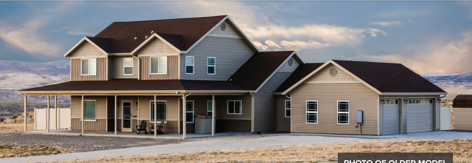
PHOTO OF OLDER MODEL

4-5 bed | 4 bath | 3 car Spring Creek, NV - by Bailey Homes