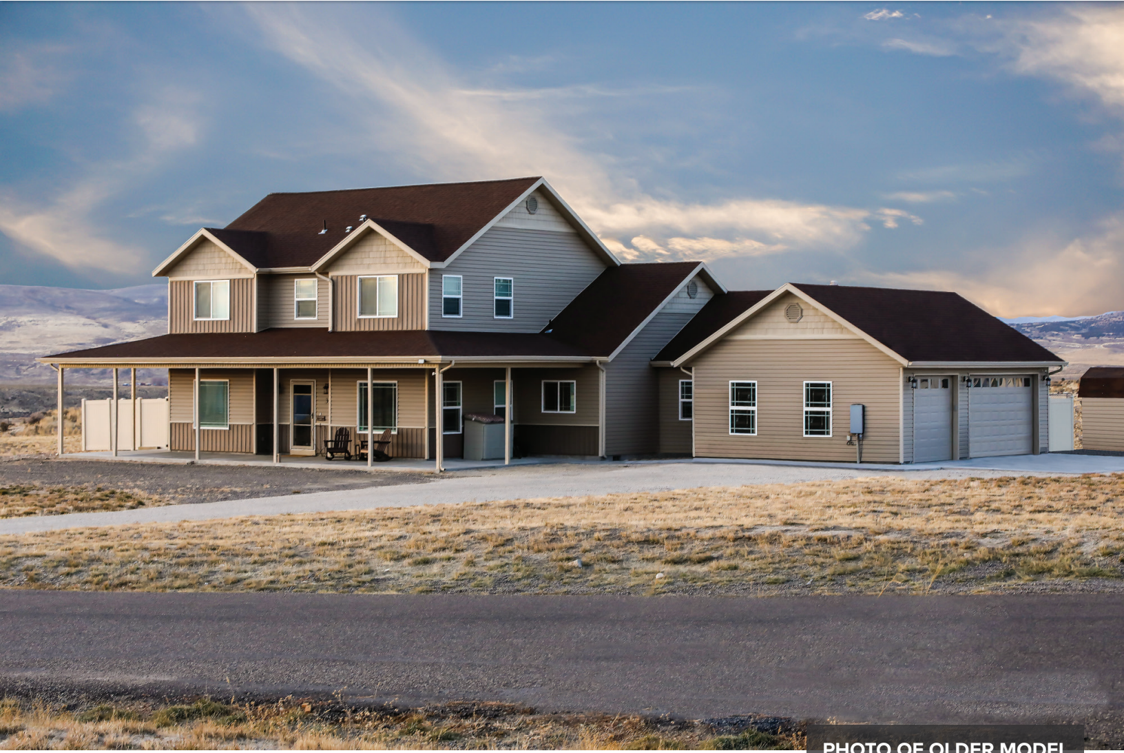
PHOTO OF OLDER MODEL

4-5 bed | 4 bath | 3 car Spring Creek, NV - by Bailey Homes